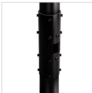
Grub screws which allow micro-adjustment of pole angle