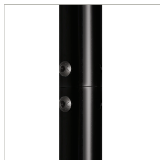
Creates a seamless pole join