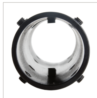
Supplied with optional short safety bolts to allow cables to pass through

GRUB SCREWS ALLOW MICRO- ADJUSTMENT OF POLE ANGLE