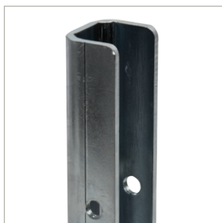
One-piece design for a quick install