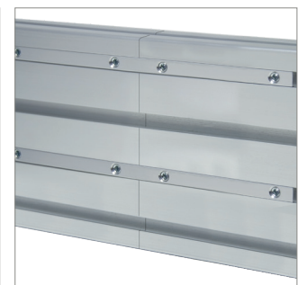
Seamless finish maintains the premium quality of the product