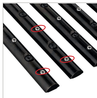
Spring-loaded bearings allow the joining bars to move easily into position